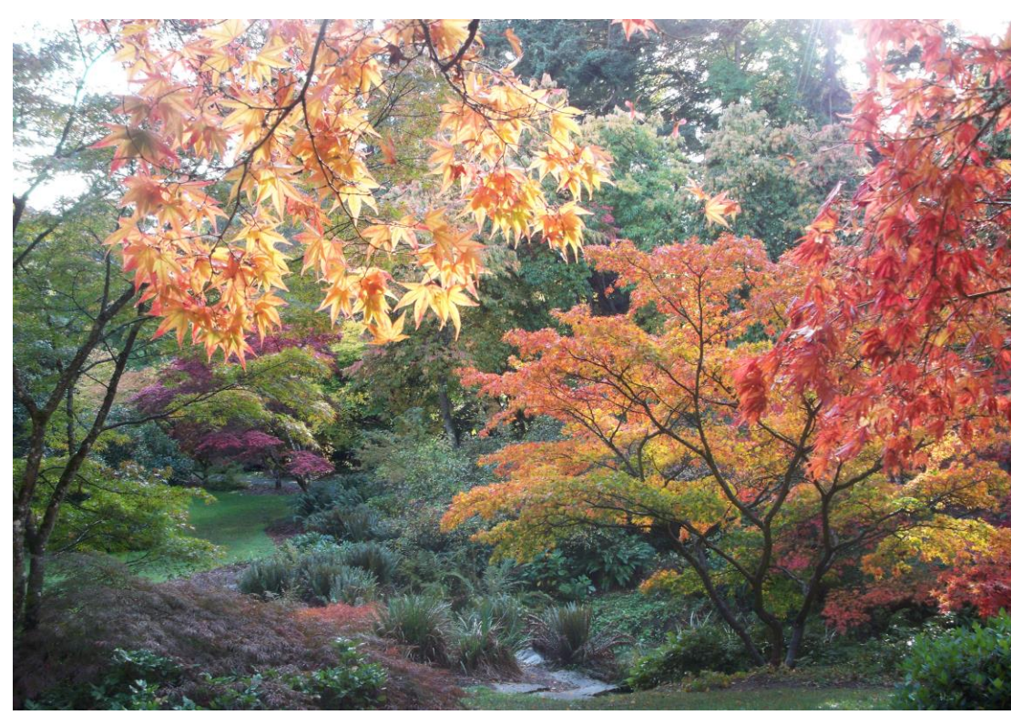
(Picture above and to the left I took at the Seattle Arboretum and bottom left is from the Japanese Gardens)

Fall has become a magical time for us. I used to feel like hiding when the days got shorter and everything was withering and dying. I was focused on the loss rather than the grace. Each year now towards the end of October, I take a trip to the Seattle Arboretum or Japanese Gardens and surround myself with indescribable colors and let myself become transported by the beauty and inevitability of the season.