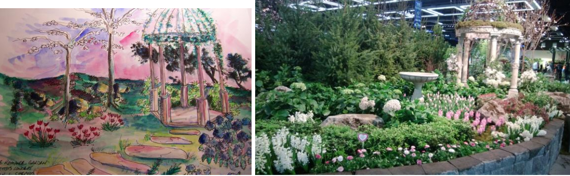
While a large gazebo surrounded by flowers is the perfect setting for romance in the garden.

The "Western" garden uses drought tolerant plantings, a hitchin' post and water trough for those thirsty horses to underscore its theme